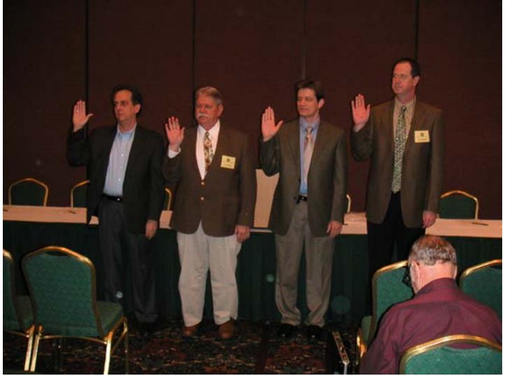
SCNA Officers Taking the Oath of Office