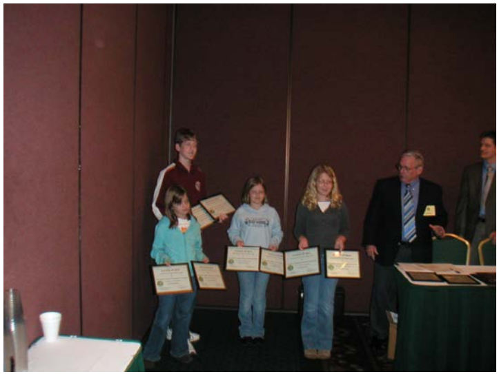
YN Exhibit Winners