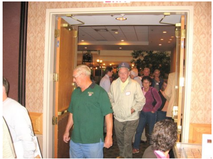
Doors Open and Eager Customers Begin Filing Through